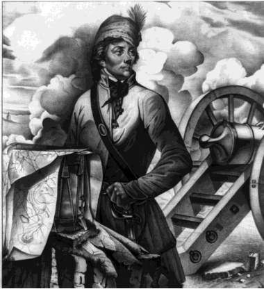
Thaddeus Kosciusko

While the young Marquis de Lafayette, was the most visible foreign presence in the American Army, particularly in the early years, men from Poland and the various German States served the American cause. Thaddeus Kosciusko and Kazimierz Pulaski, “the Father of the American Cavalry,” were from Poland, Johan DeKalb was from Bavaria, Friedrich Wilhelm von Steuben was from Prussia, and Louis Lebeque DuPortail, like Lafayette was from France. These men all served within the structure of the Continental Army, made significant contributions to various aspects of the war’s efforts, and in the case of DeKalb and Pulaski, gave their lives to the cause. DeKalb was mortally wounded at the battle of Camden and Pulaski was killed during the siege of Savannah.