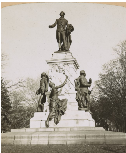
Statue of the Marquis de Lafayette in Lafayette Park, Washington, D.C. Photograph provided by H.C. White Co., 1900 (Library of Congress)

In Lafayette Park stand public monuments to these foreign fighters who helped birth the new United States.