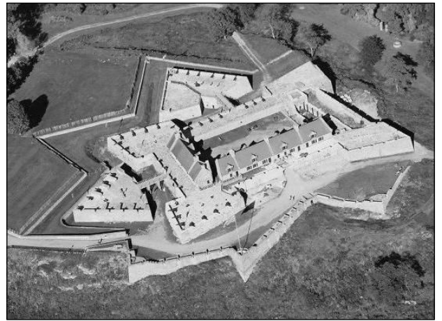
Model of Fort Ticonderoga when it was built in 1755 as Fort Carillon

In upstate New York at the critical junction where Lake George and Lake Champlain are connected at the outlet of the La Chute River stands the iconic structure, Fort Ticonderoga. Originally built by the French in 1755 and called Fort Carillon, the site was important to numerous events during the French and Indian War (1754-1763) and the Revolutionary War (1775-1783). Upon its completion it was deemed impregnable and given the nickname, “the Gibraltar of North America.” The stone walls of the fort stood eleven feet high and were four feet thick surrounded by a large moat. Inside the fort sat a parade ground surrounded by officer’s and regular troops barracks as well as several storehouses for supplies and powder. Fort Ticonderoga was a strategically important point on what at that time was the American frontier. It guarded the southern end of Lake Champlain protecting the vital trade route between Canada and the Hudson River in New York. Whoever controlled it controlled that access. Ticonderoga is an Iroquois Indian name for “the place of two rivers.” It was designed as a five-star point, reflective of the military architecture of the age. This configuration provided for maximum firepower from the walls as troops making a direct attack would invariably be caught in a crossfire from defenders. In 1758 only