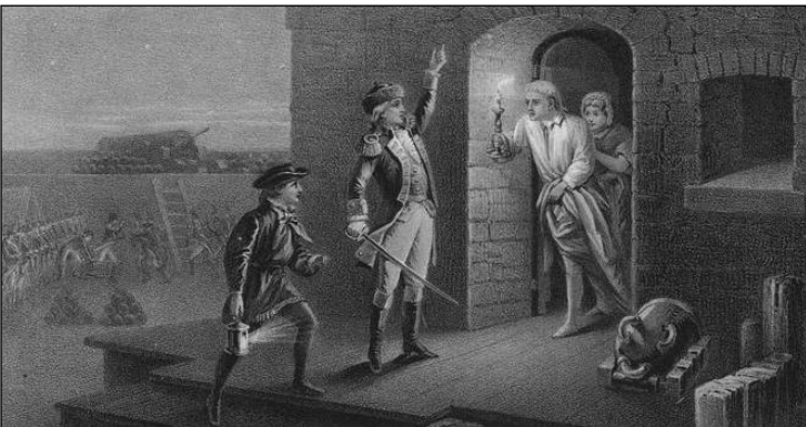
Later depiction of Ethan Allen overrunning Fort Ticonderoga from the British.

After the French and Indian War Fort Ticonderoga became a British garrison and outpost and did not reemerge in American history until May 10, 1775. On that date the fort and its small command was attacked by Ethan Allen and his Green Mountain Boys, a paramilitary group of American patriots from what is today the State of Vermont, joining them in the assault was Benedict Arnold who represented the Continental Army. Allen and Arnold, men each with large egos vied for command of the expedition and eventually according to some, but not all historians settled on a co-command, even though Arnold was there by himself. The fort was undermanned, the walls crumbling, and the sentries easily overrun. Allen led the nighttime assault over the parapet and allegedly woke up the post commander who asked on whose authority Allen was acting. Apocryphally Allen bellowed, “In the name of the Great Jehovah and the Continental Congress.”