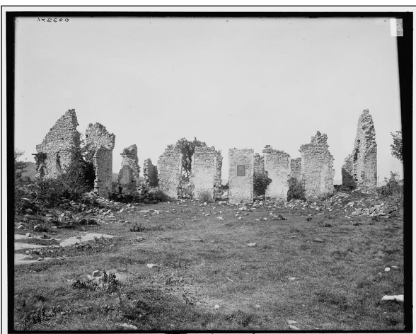
Ruins of Fort Ticonderoga in 1909, immediately before its reconstruction.

This early American victory in the nascent American Revolution was not only of strategic significance, but with the capture of the fort its large cache of artillery fell into American hands. The following winter as George Washington's Continental Army had the British Army bottled up in Boston with a siege, Washington's Commander of Artillery, Henry Knox proposed that he lead an expedition to Fort Ticonderoga, remove the guns, and haul them to Boston to force the British hand. Knox set out with his hearty contingent in November 1775 cutting through the Massachusetts and New York wilderness. Knox was able to secure the fort's guns and with the help of teams of oxen bring the captured artillery back to Boston by March 1776. The expedition encountered much hardship, particularly on the return as they battled blinding snowstorms, rugged terrain in the Berkshire Mountains, and crossed several ice-choked rivers, but not a single gun was lost and with the fresh artillery in place on the heights overlooking Boston, Washington was able to complete his fait accompli . The guns from Ticonderoga made staying in Boston untenable and the British evacuated the city.