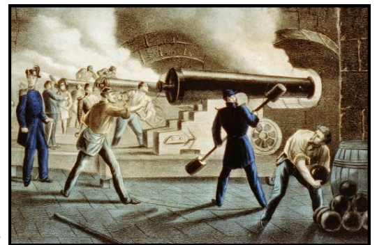
Fort Sumter was targeted by 4,000 Rebel cannons and mortars.

Abraham Lincoln immediately took steps to preserve the still-neutral states of Kentucky, Missouri, and Maryland. Huge paddle steamers with motley assortments of heavy firepower appeared in the Midwestern rivers and the newly formed "Army of the West" was dispatched to Missouri.