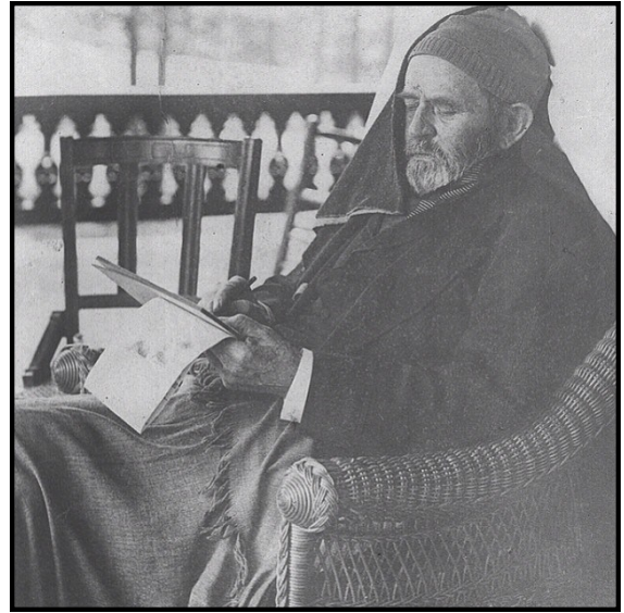
Ulysses S. Grant writing his memoirs in 1885, weeks before his death.

“I would have given anything then to have been back in Illinois, but I had not the moral courage to halt and consider what to do; I kept right on.