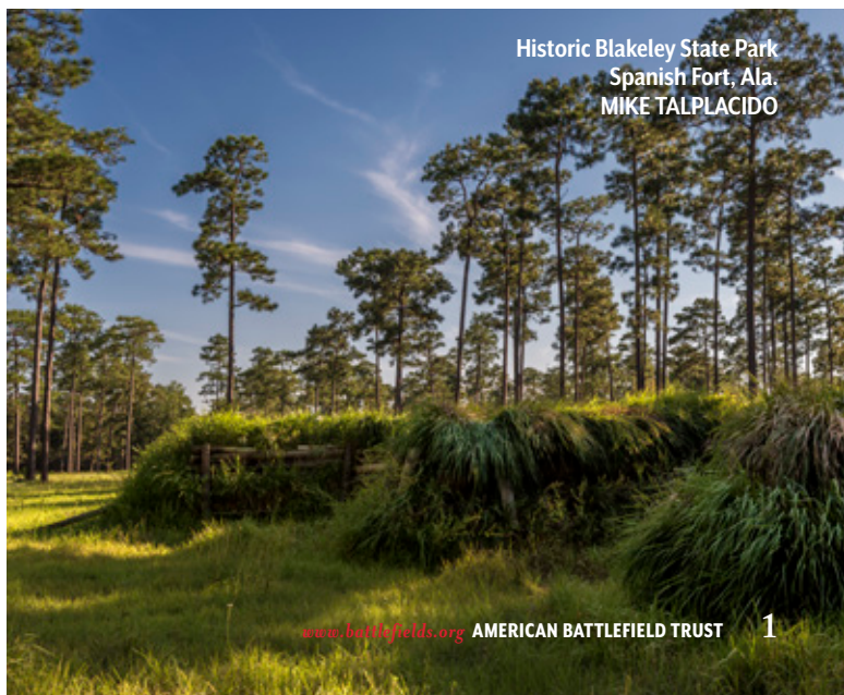
Historic Blakeley State Park Spanish Fort, Ala. MIKE TALPLACIDO

In the 2025 calendar year, the American Battlefield Trust completed 35 transactions, permanently protecting more than 2,015 acres of hallowed ground at 29 battlefields in ten states. The total value of land saved exceeded $36 million, but thanks to numerous matching grants and other revenue sources, the Trust was able to leverage its members' donations by a factor of 4.66 to 1.