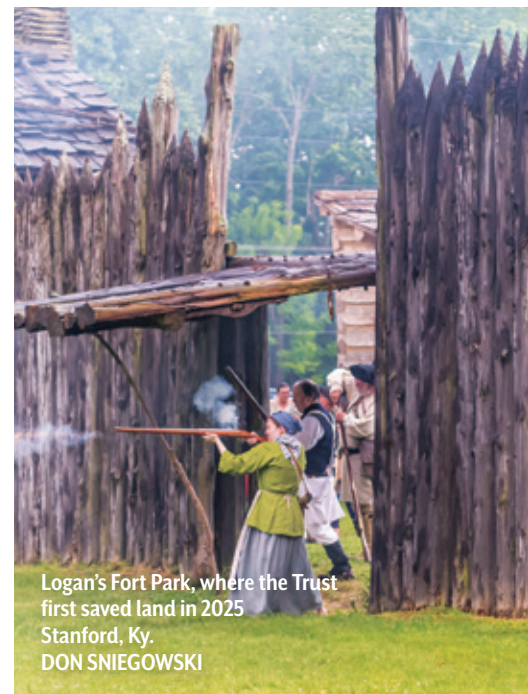
Logan's Fort Park, where the Trust first saved land in 2025 Stanford, Ky.

AbbVie; Boeing; Cleveland-Cliffs Inc.; Dominion Energy; Duke Energy; Eli Lilly & Company; Fertilizer Dealer Supply Co.; FM Global; Johnson & Johnson; Kirkland and Ellis; Liberty Mutual; Lockheed Martin Corporation; The Pew Charitable Trusts; Pure Storage; Raytheon Technologies; Regeneron; Wide Awake Films