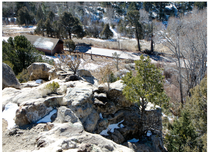
Glorieta Pass — the "Gettysburg of the West," where Union forces halted Confederate ambitions in the Southwest.

Every acre matters because every acre is connected to something bigger.