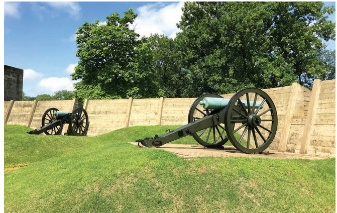
Corinth — where crucial rail lines made this Mississippi crossroads a strategic prize of the Civil War.

Just last year, at Resaca, the land we are seeking to save was nearly rezoned for industrial development, including warehouse and distribution facilities along the busy I-75 corridor between Atlanta and Chattanooga. Fortunately, local residents pushed back and the rezoning failed.