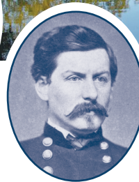
General George McClellan

Burnside Bridge at Antietam, where Union troops fought desperately to cross Antietam Creek under intense Confederate fire.