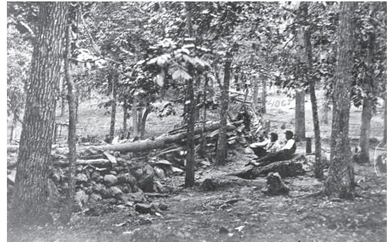
The 150th New York moved from the target tract on the Baltimore Pike to these works of earth and stone, seen on Culp's Hill two weeks after the Battle of Gettysburg.