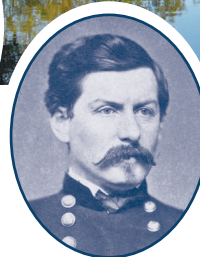
General George McClellan

Burnside Bridge at Antietam, where Union troops fought desperately to cross Antietam Creek under intense Confederate fire.