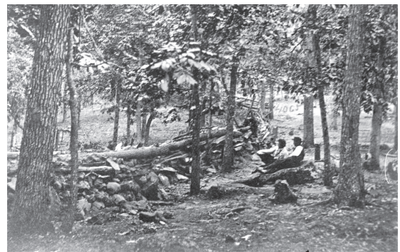
The 150th New York moved from the target tract on the Baltimore Pike to these works of earth and stone, seen on Culp's Hill two weeks after the Battle of Gettysburg.

To get a sense of the importance of the remarkable land we have the chance to save today, let's travel together to July 1863. Located at the base of East Cemetery Hill, this property witnessed tens of thousands of Union troops who marched directly to and from Gettysburg throughout the battle. New York, Pennsylvania, and Maryland soldiers crossed this ground while protecting the Pike and reinforcing Culp's Hill.