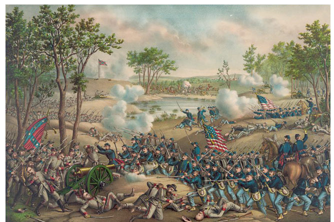
Scene of the Battle of Cold Harbor, where in June 1864, nearly 7,000 Union soldiers fell in under an hour during one of the war's bloodiest assaults. Battle of Cold Harbor

Two years later, on June 1, 1864, the same tract was in the path of the Union Sixth Corps' opening assault during the Battle of Cold Harbor. The main Confederate line stood just about 500 yards to the west of this property, and later, the main Union line stood immediately behind it during the trench warfare that characterized Cold Harbor.