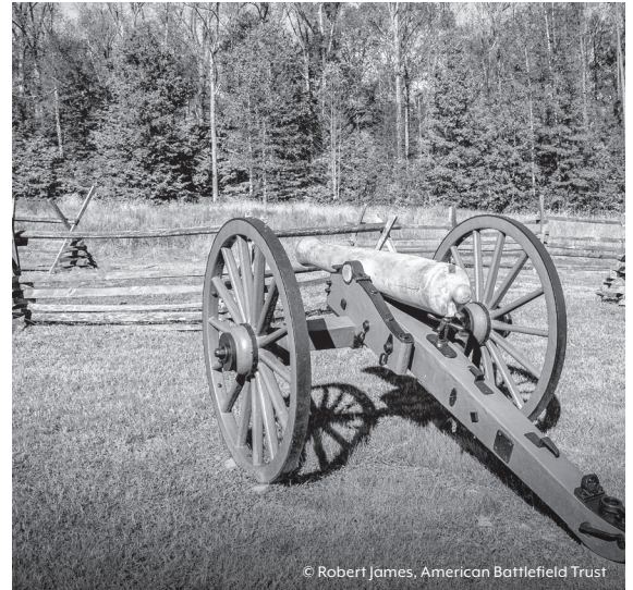
Gaines' Mill — a hard-fought Civil War battle remembered for its staggering losses and fierce combat.