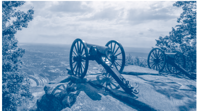
Help save land associated with Union General Ulysses S. Grant, who fought a series of battles to end the siege of Chattanooga.

But I also know there are history fans who aren't able to travel as much as they'd like. There are school groups with limited budgets and families who are simply too far away from these hallowed acres to walk them. And there are Civil War buffs around the world who want to experience our history but can't!