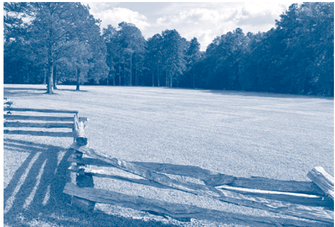
Protect two tracts central to the Battle of Bentonville, the last large-scale battle of the Civil War.