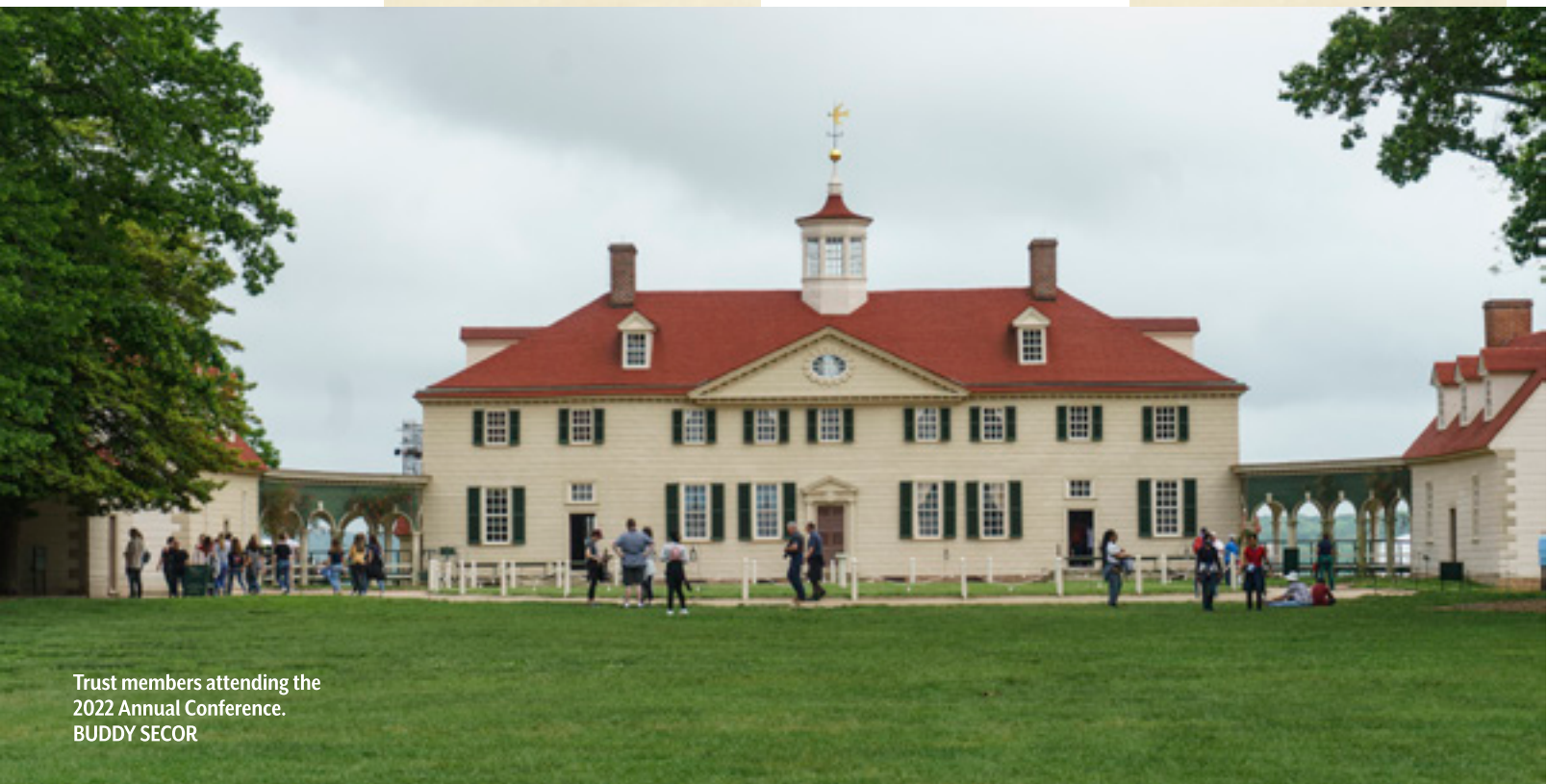
Trust members attending the 2022 Annual Conference.