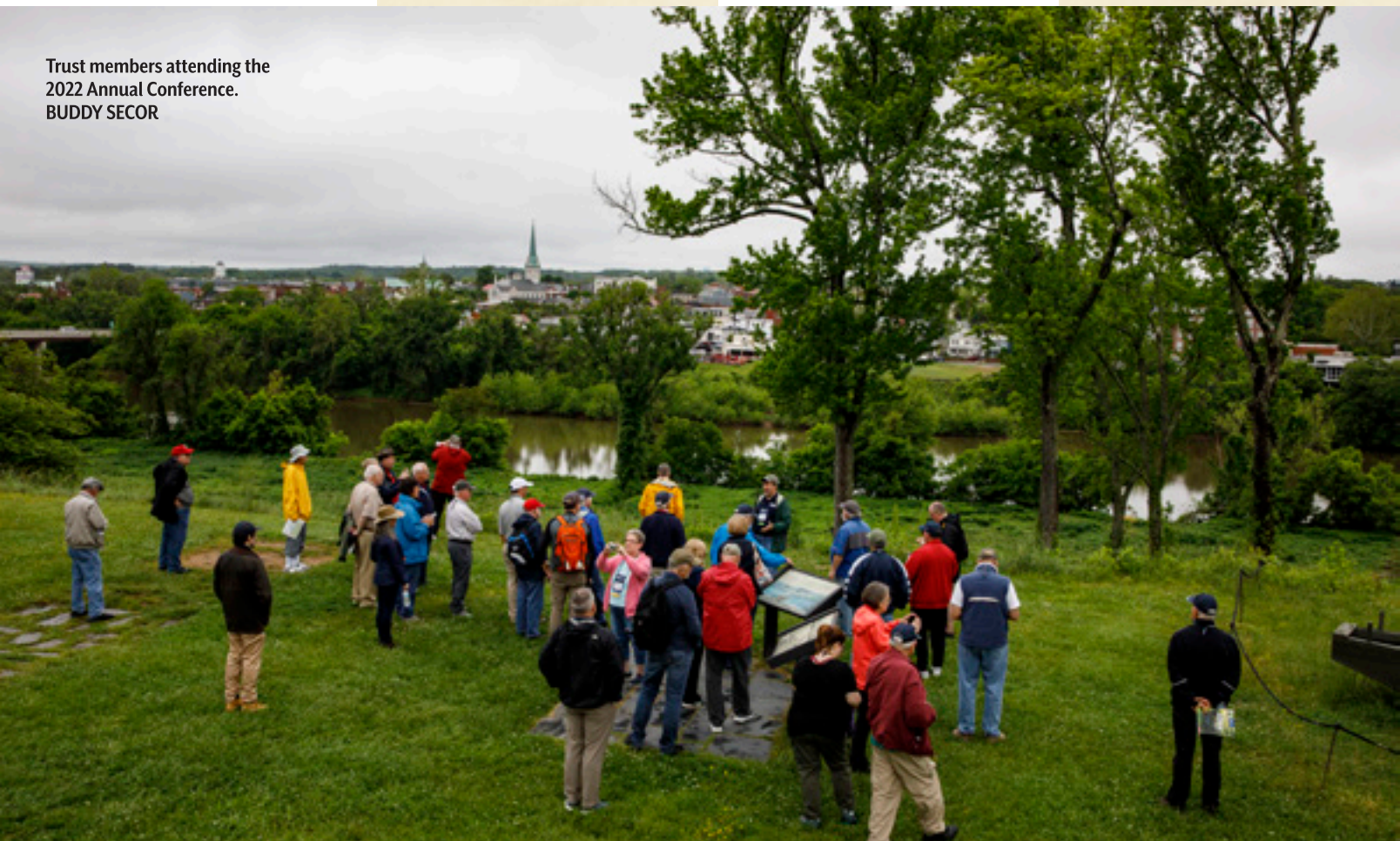
Trust members attending the 2022 Annual Conference.