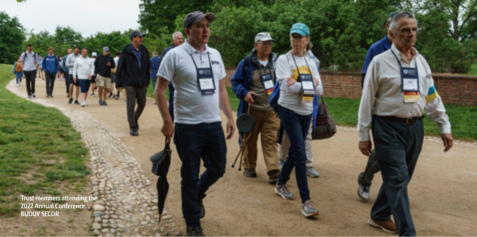
Trust members attending the 2022 Annual Conference.