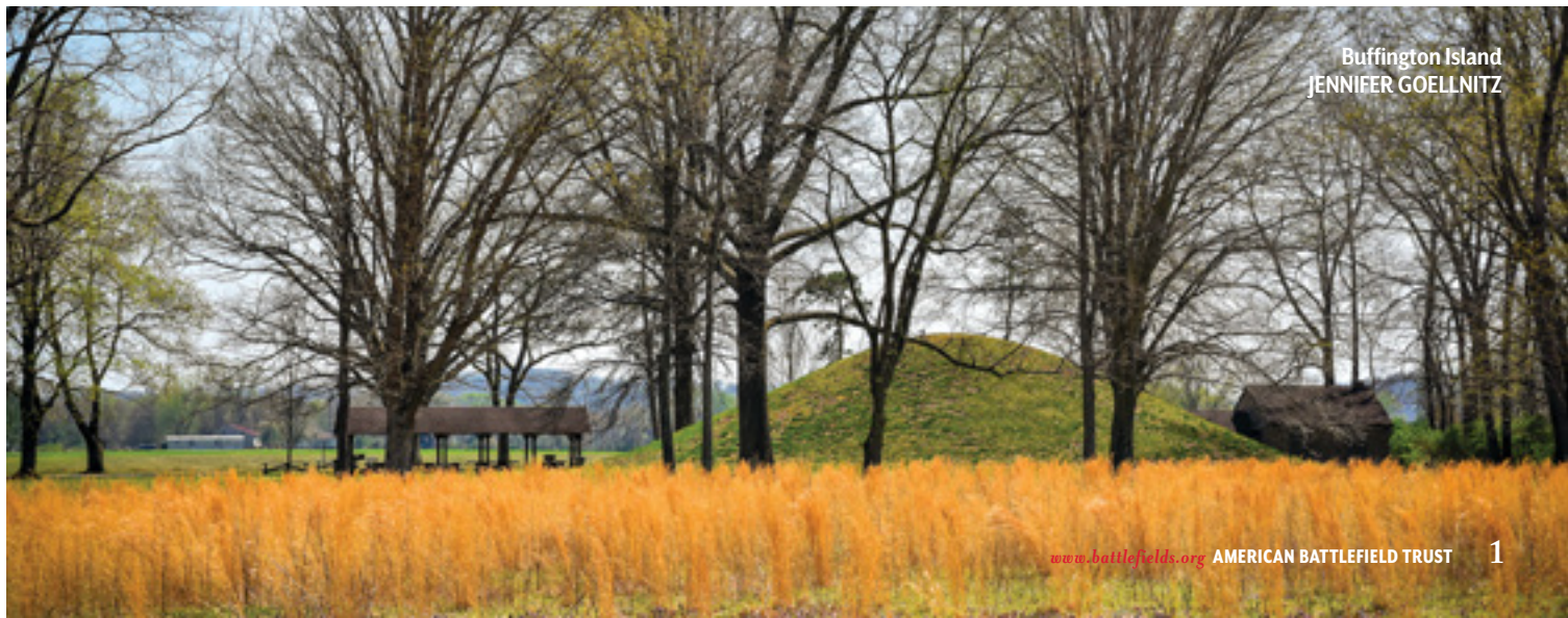
Buffington Island JENNIFER GOELLNITZ

Between January 1, 2022, and December 31, 2022, the American Battlefield Trust completed 30 individual transactions, protecting a total of 1,282 acres at 23 battlefields in 11 states. This land is valued at over $19,282,849, but thanks to a host of matching grants and other revenue sources, the Trust secured its preservation through a net cash outlay of approximately $2,153,722 — a leverage factor of 9-to-1.