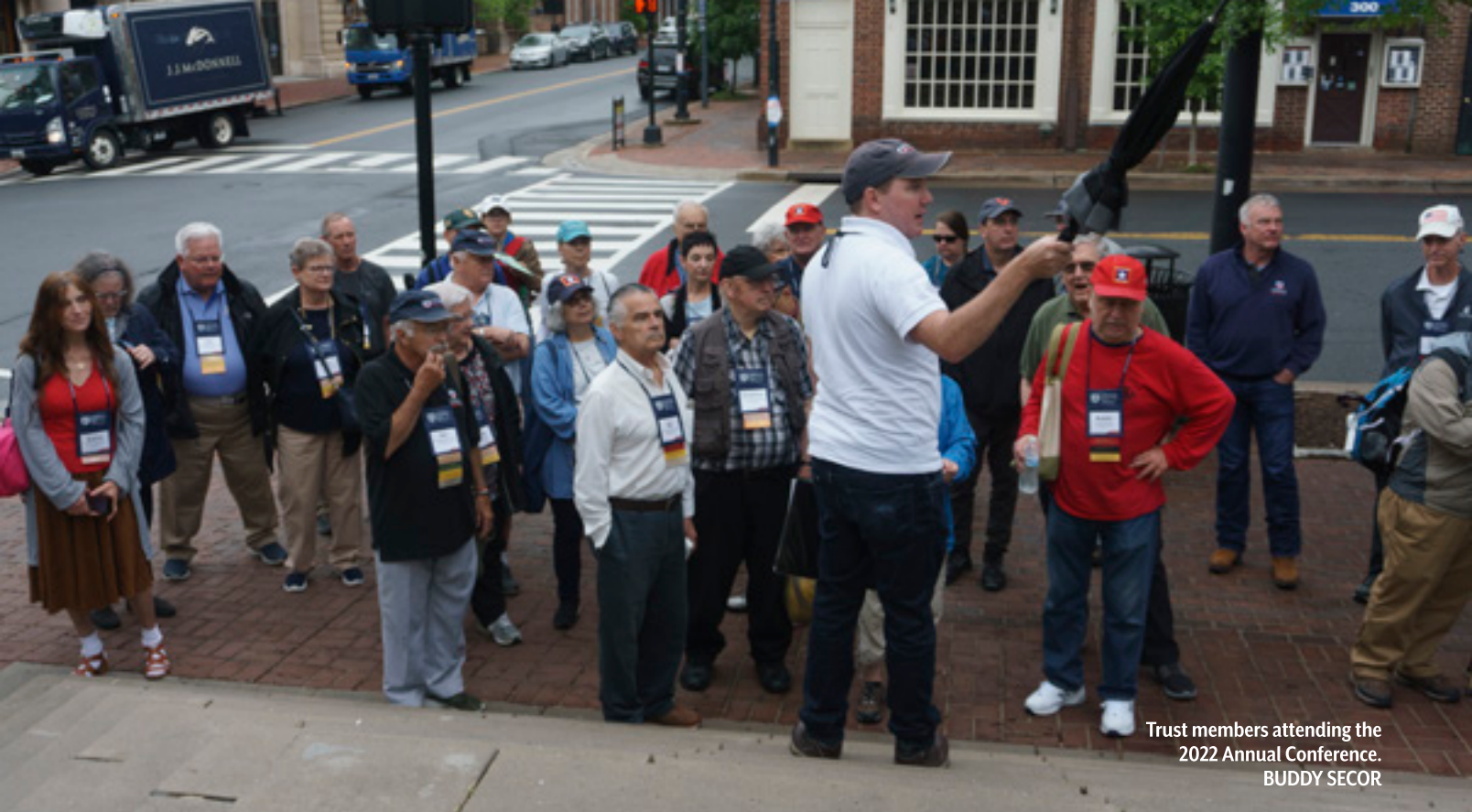
Trust members attending the 2022 Annual Conference.